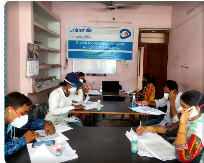
SMNet monitored 54,003 home isolation cases in 75 districts from August to September. SMNet's daily monitoring and feedback shared with the government led to increased Rapid Response Team (RRT) visits, availability of pulse oximeters, availability of Ivermectin and COVID-19 cases in home isolation.