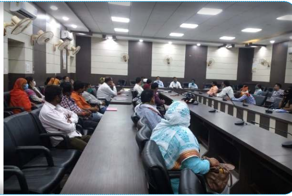
SMNet coordinated capacity building efforts for orientation of 44,149 Pradhans and 9,362 village development officers. 3,135,826 migrants were supported by Nigrani Samitis.