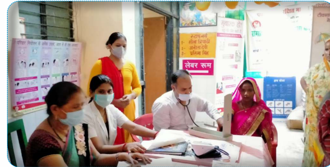
UNICEF revised the plans for Pradhan Mantri Surakshit Matritva Abhiyan (PMSMA) monitoring, suspended due to the pandemic onset, by developing mobile-based app for monitoring. SMNet monitored 124 PMSMA sessions in August and September 2020.