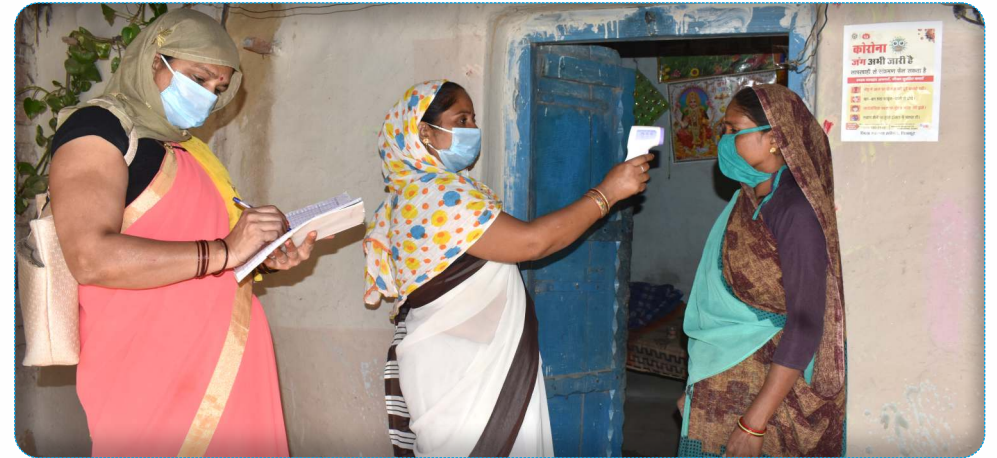
To control and prevent further transmission of COVID-19 virus, the Government of Uttar Pradesh initiated Vishesh Surveillance Abhiyan (VSA). SMNet supported microplanning, trainings and monitoring (jointly with WHO and PATH) of House to House teams. SMNet monitored 67,600 households in 431 blocks of 60 districts to provide supportive supervision to 13,473 teams.

SMNet supported the government in Dastak Abhiyan July round monitoring. The monitoring findings were shared daily across the 60 SMNet districts, 17 divisions and at state level.