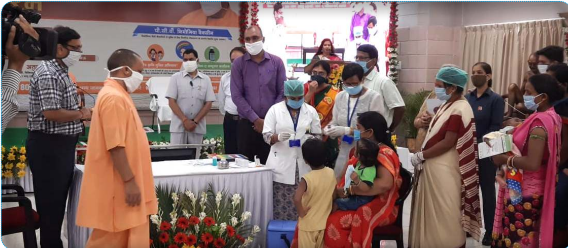
Hon'ble Chief Minister of Uttar Pradesh launched Pneumococcal Conjugate Vaccine (PCV) in 56 districts on 10 August. UNICEF provided technical assistance in trainings at state and district levels through SMNet particularly on communication, sensitizing media and the event launch.