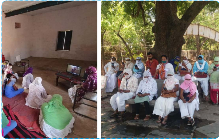
Strong advocacy technique was adapted for the mainstreaming of RMNCH + A services with COVID-19 and resuming essential Maternal, Newborn and Child health (MNCH) services at the community level with online learning webinars.