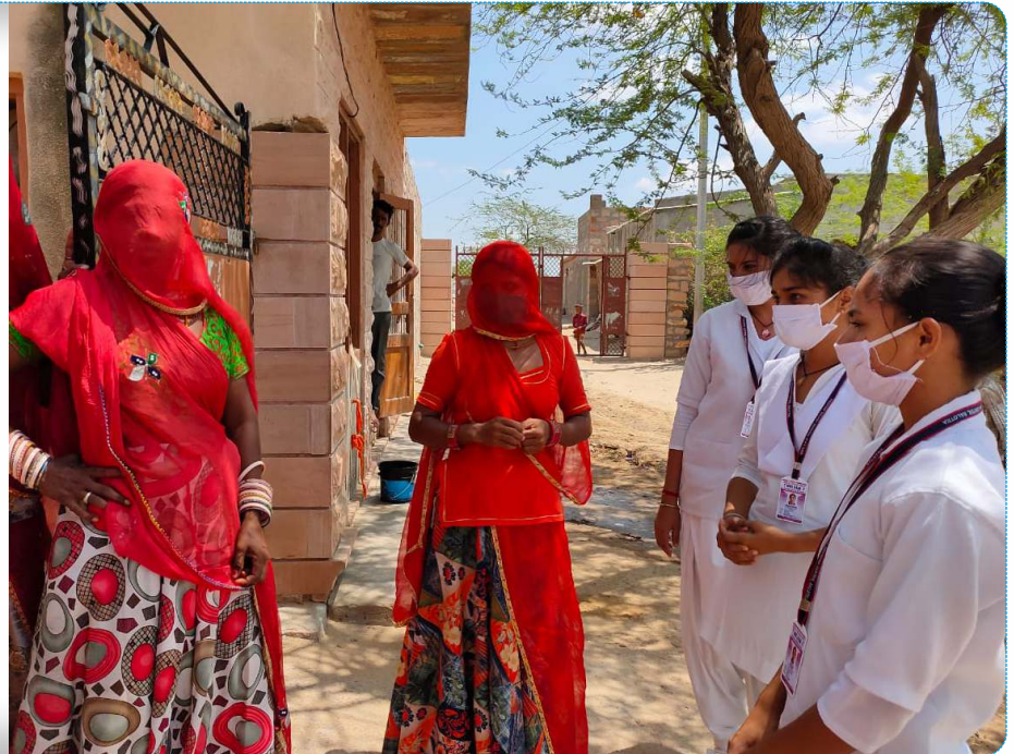
Overall, almost 60,000 health workers were trained on COVID-19 related topics.