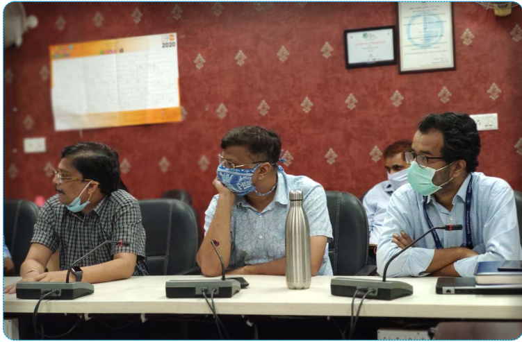
UNICEF, in partnership with WHO and UNFPA, adapted a systematic way of designing COVID-19 protocols.