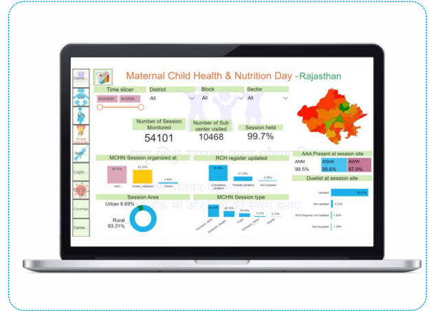
Extensive support was provided in establishing strong supportive supervision mechanism and regular feedback sharing structure with interactive dashboards, videos and webinars.

System strengthening support was given for community engagement planning and sector level factsheet for review wherein more than 5,000 sector meetings were monitored.