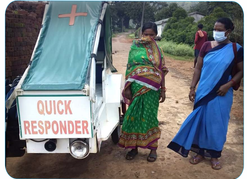
The Bike Ambulance is used for carrying the pregnant woman and ASHA for delivery to the Delivery Van or the nearest health centre.