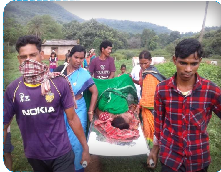
ASHA and Panchayat members carry a pregnant woman for delivery to the Delivery Van.