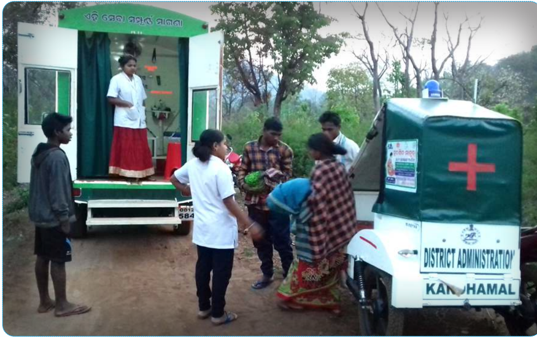
The pregnant woman then gets transferred first, from the Bike Ambulance to the Delivery Van.