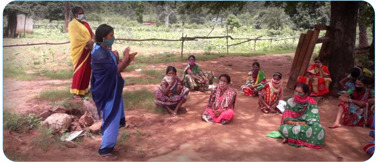
The communities in the hard to reach areas are reached through ASHAs on COVID protection measures.

Kandhamal comprises of 52 per cent tribal population and 805 inaccessible villages that were severely affected during the COVID lockdown.