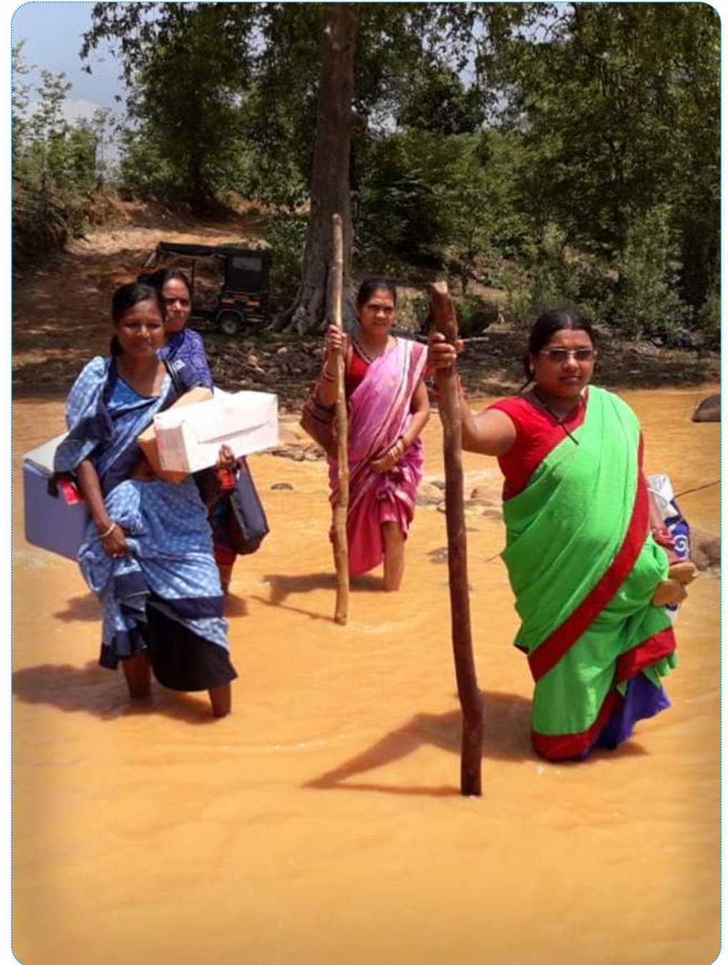
Along with this, the front-line workers provide ANC services and vaccination to kids under the integrated Village Health and Nutrition Days Routine Immunization of the SAMMPurNA strategy of the Government of Odisha.