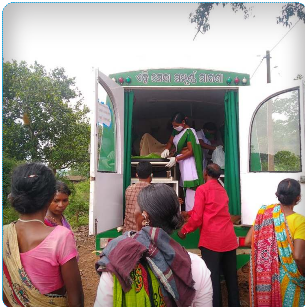
In the Delivery Van, the staff nurse examines the pregnant woman and arranges for the safe delivery of the child.