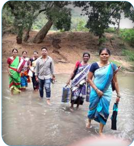
The health workers travel long distances crossing lands and waterfronts to provide outreach services in Kandhamal.