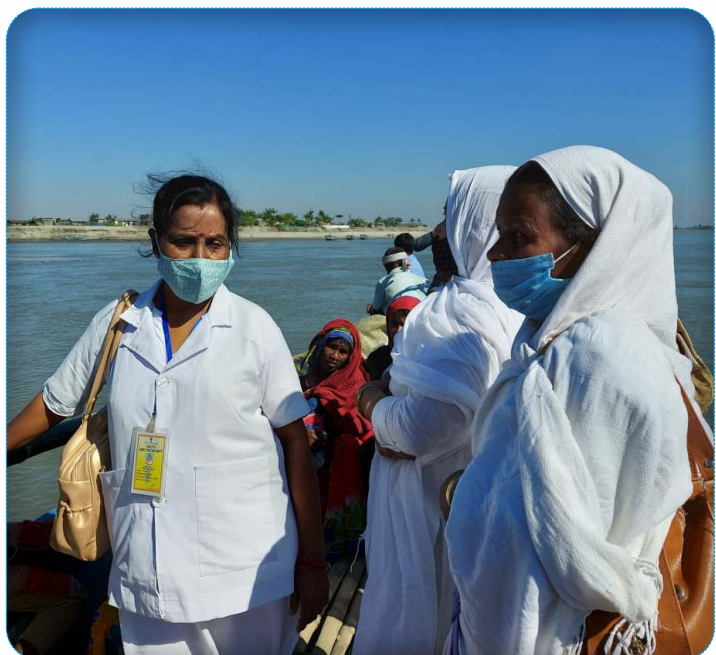
Teams of Accredited Social Health Activists (ASHAs), Auxiliary Nurse-Midwives (ANMs), Multipurpose Workers (MPWs), Medical Officers (MOs) and Lab Technicians (LTs) worked with an aim to reach 28,000 villages, covering the entire 3 crore population.