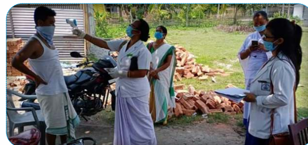
On the second day, the MO visits and verification of lines were completed.