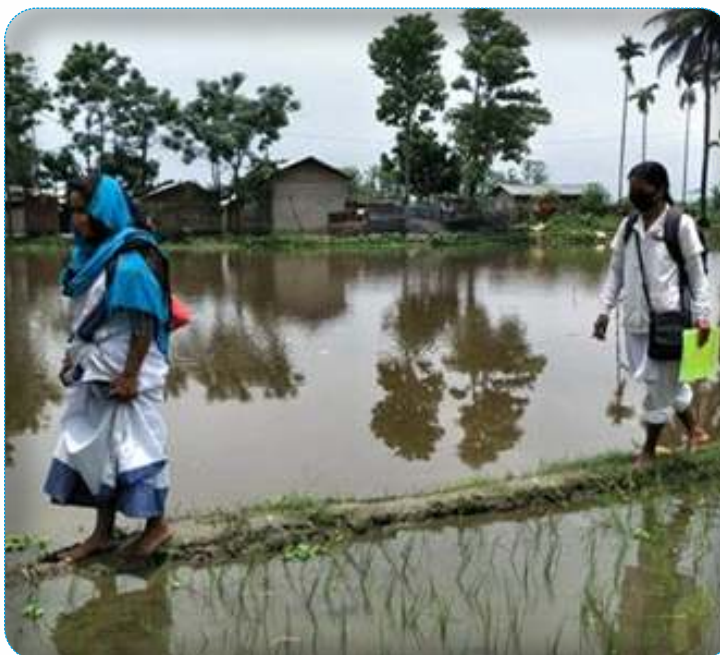
The Assam Community Surveillance Programme (ACSP) teams waded through floodwaters to reach various villages and hard to reach areas.