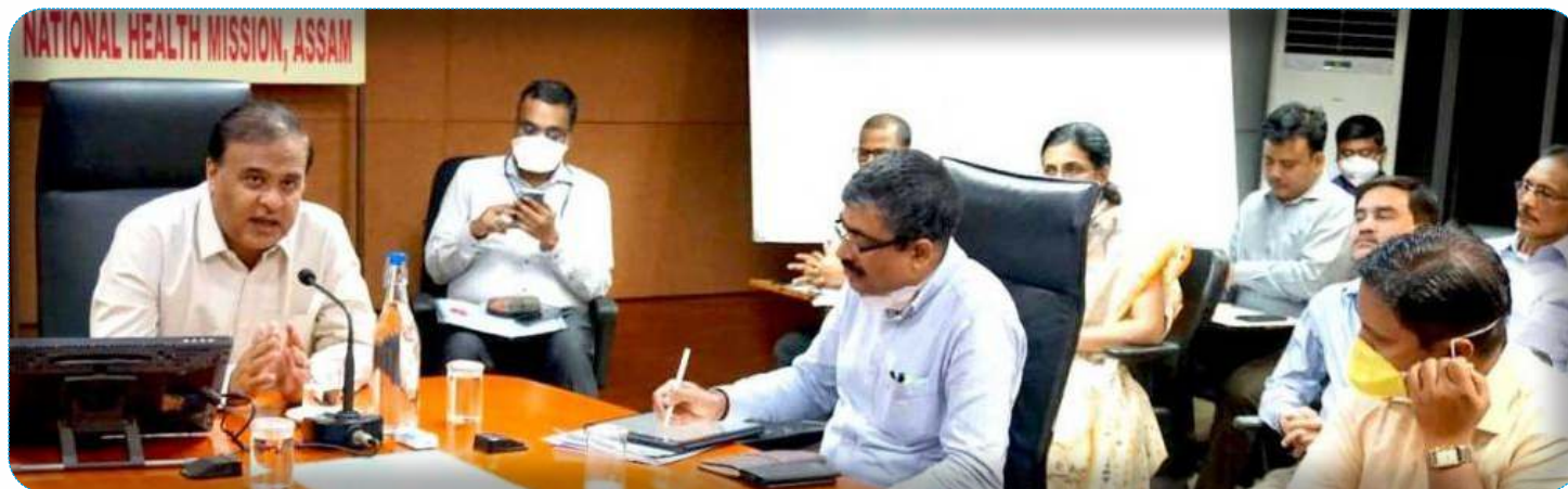
On 7 March 2020, the State of Assam launched a Community Surveillance Programme to screen the cases of Severe Acute Respiratory Infections (SARI), Influenza Like Illness (ILI), Malaria, Dengue etc.