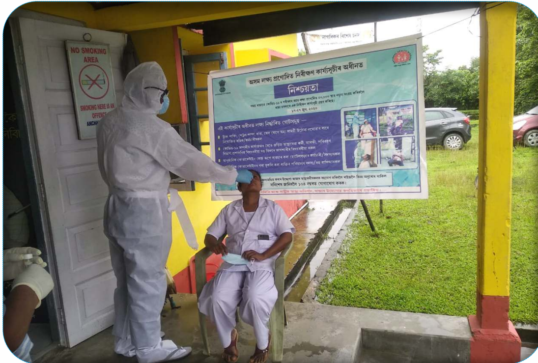
The teams were successful in reaching 1.98 crore population across 21,499 villages.