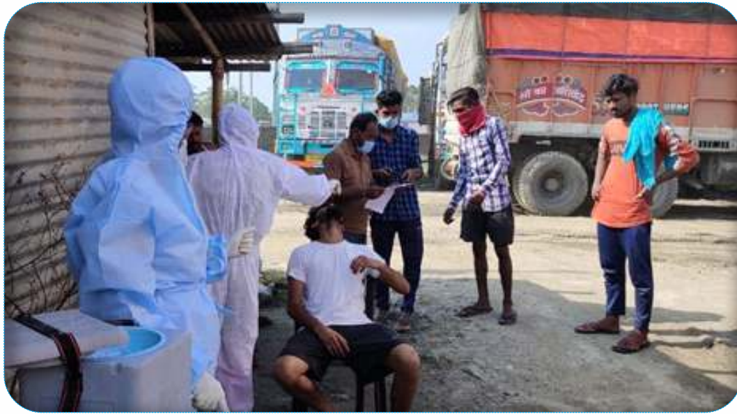
On the third day, LT visits for sampling were done.