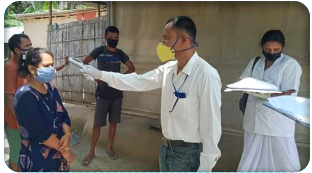
Health workers visited houses and helped people to identify minor flu cases.