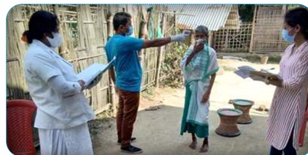
On the first day, the ASHAs visited houses and completed line listings.