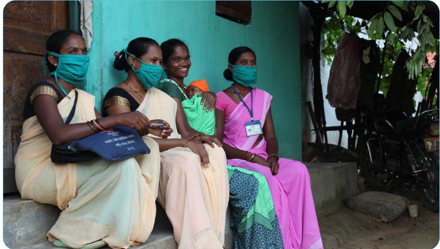
With the constant support from the team of ASHAs, AWWs, ANMs, Medical Officers, there are many such stories of saving low birth weight babies in Gadchiroli District through home-based KMC.