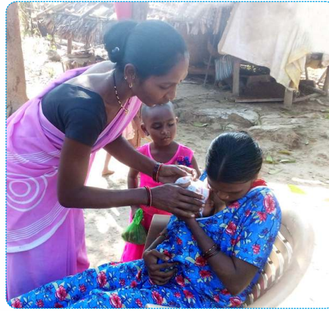
Home-based KMC was practiced by the mother of low birth weight baby in Chamorshi Block, after proper training and guidance.