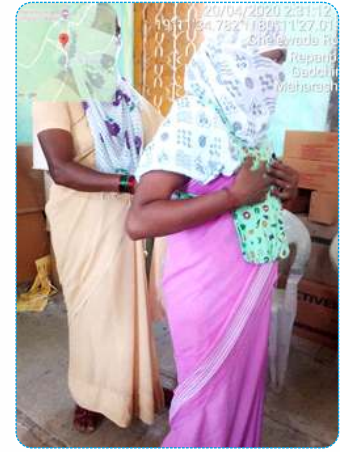
Gatpravartaks (ASHA facilitators) demonstrated KMC at VHSNDs.