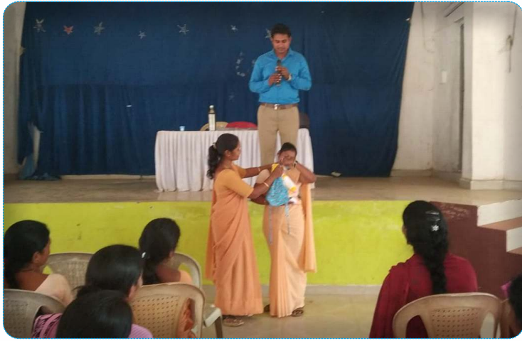
Similarly, home-based KMC trainings were done in Chamorshi Block.