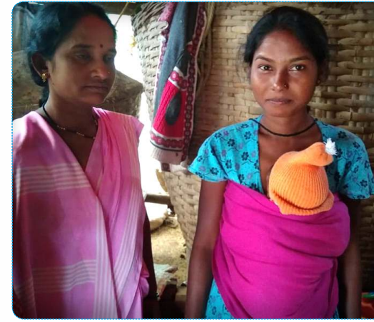
Mothers who initiated on KMC, continued to practice KMC at home.