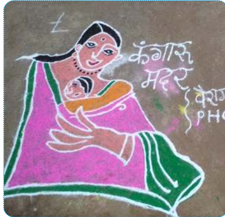
Beautiful rangolis were drawn by ASHA for promoting KMC.