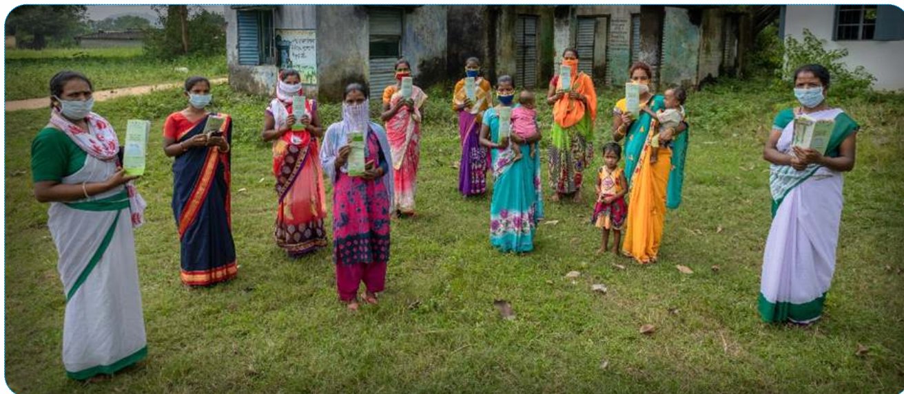
Some of the beneficiaries of marginalized and vulnerable communities who were benefited by the services at the VHND session.