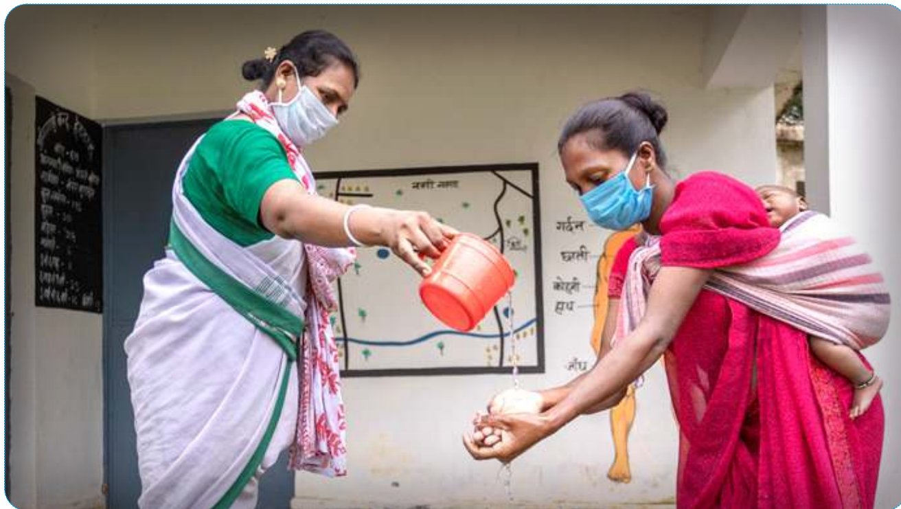
They conducted VHND sessions for providing essential Maternal & Child Health services with COVID appropriate guidance like handwashing and mask use.