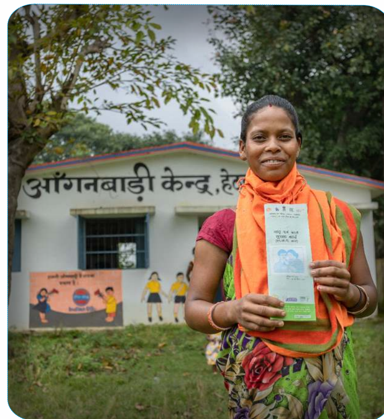
This kind of outreach by dedicated Sahiyas and ANMs helped in rebuilding the trust of mothers and pregnant women in seeking essential health care services even in the hard to reach areas.