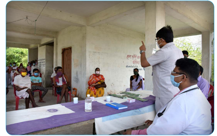
Community meetings were conducted on flood preparedness and response.