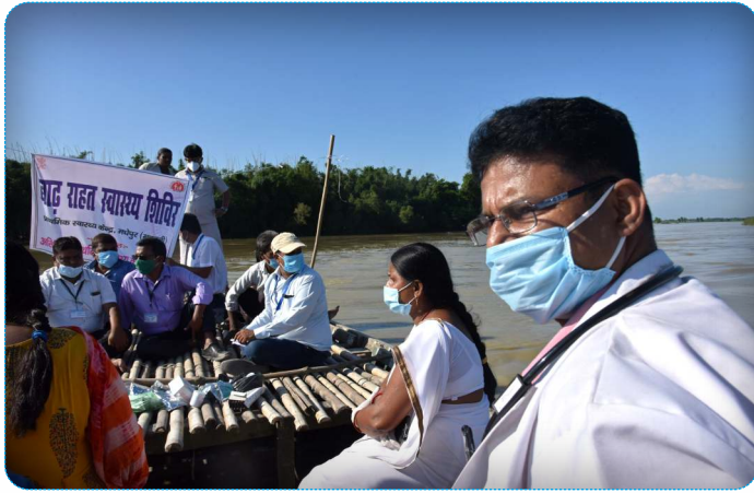
District Health team visited the flood-prone area to monitor the quality of care and provide supportive supervision in the COVID times.