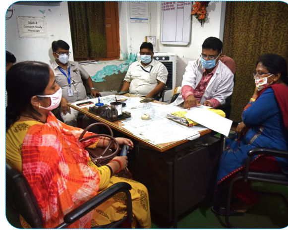
Planning and Coordination meetings were set up on disaster preparedness to cope up with the situation in Madhubani amidst COVID scenario.