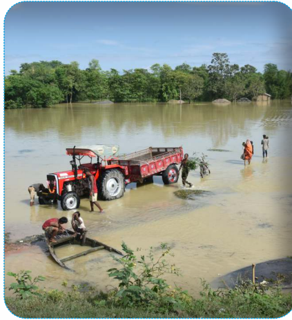
Floods caused rivers to swell, leading to breach in embankments at several places like in the Madhubani District of Bihar.