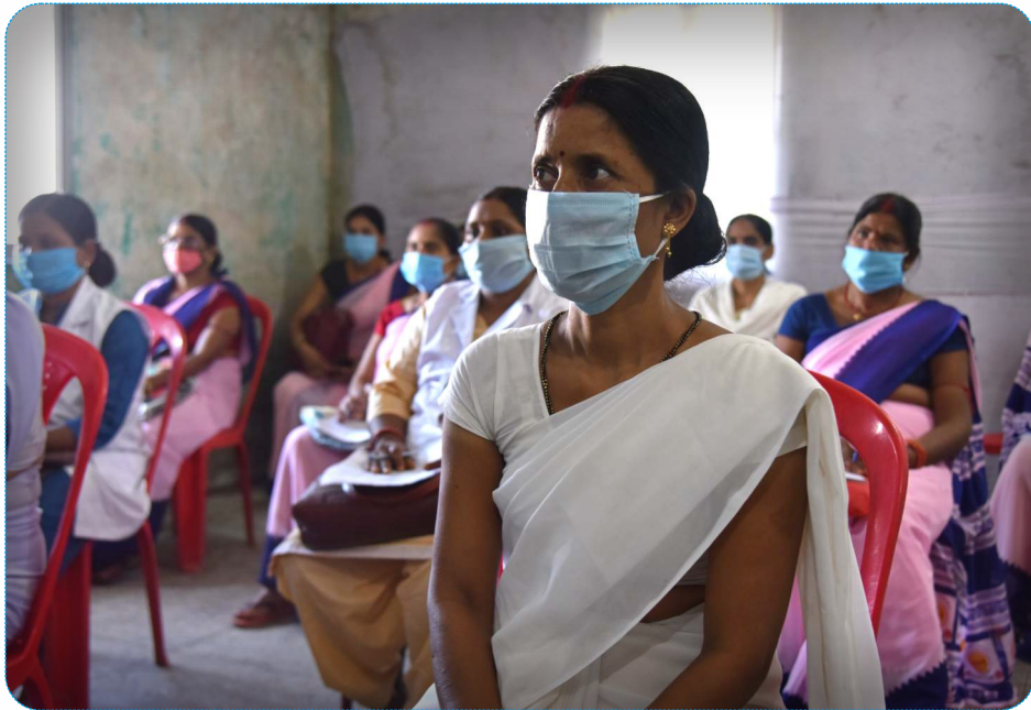
Field-level workers like ANM, ASHA and ASHA facilitator were orientated on flood preparedness and response.