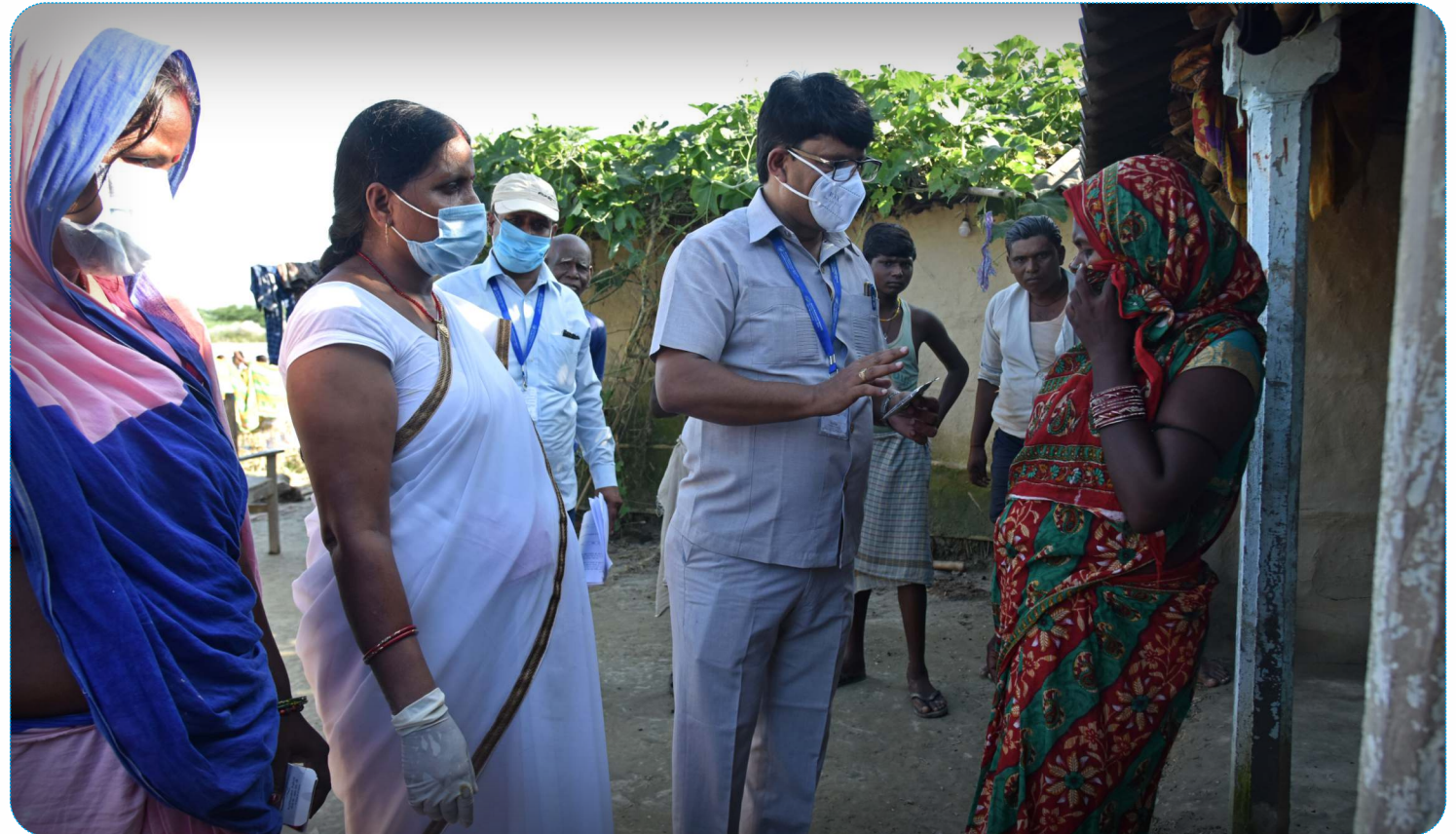
Field-level workers briefed the villagers on Infection Prevention and Control practices in flood prone areas of Madubani District.