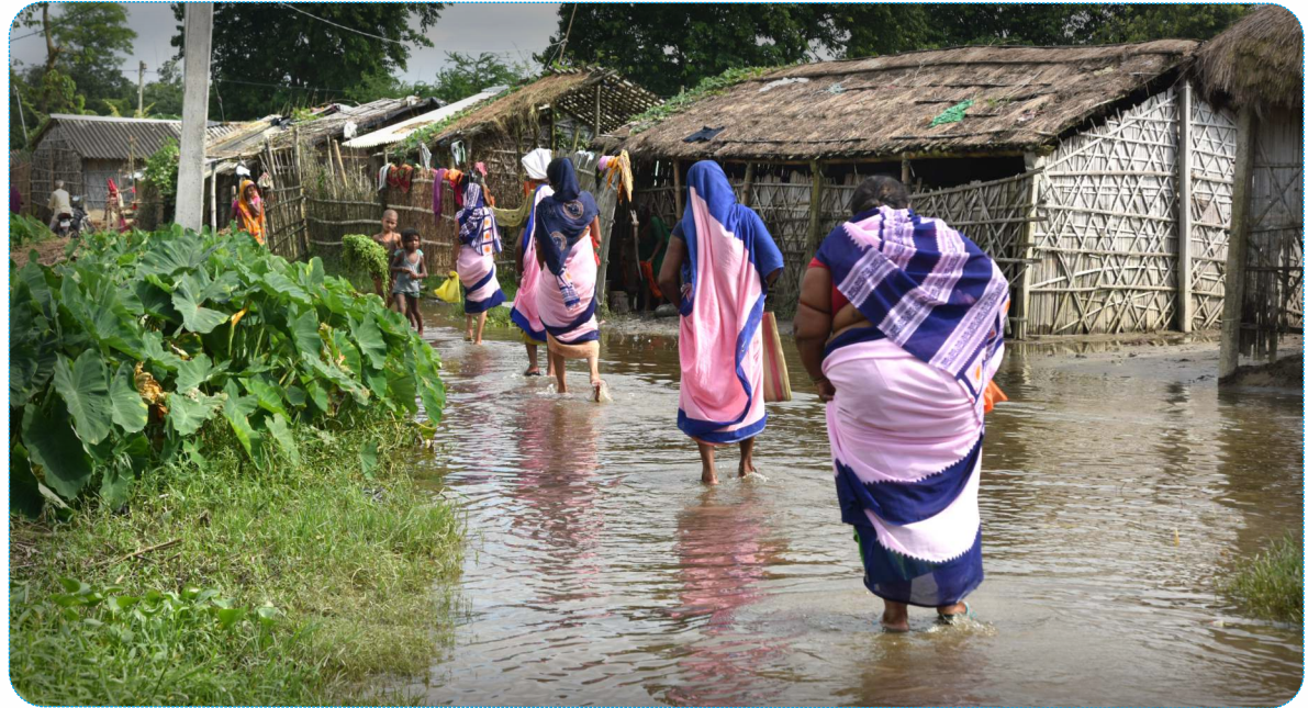
ASHA and ASHA facilitator visited the flood-prone area during their regular House to House visits.