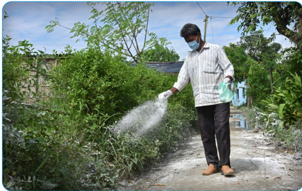
Bleaching powder was sprayed in every corner by the health workers in the flood-affected area of Madhubani.