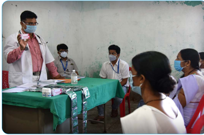
Primary Health Care doctor demonstrated the use of Zinc to ANM, ASHA and ASHA facilitator in Madhubani.